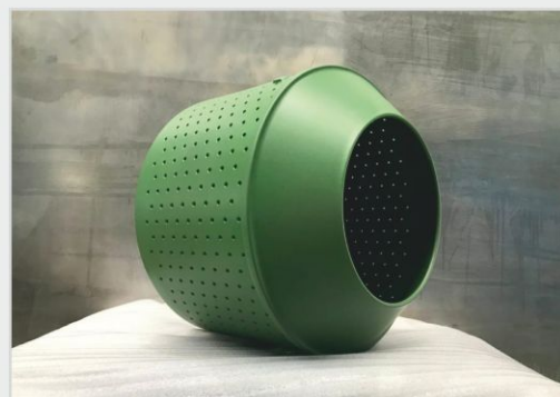
ETFE Coating (Tefzel)