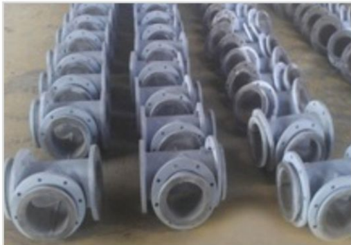
Rubber Lined Pipes & Fittings