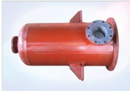
Mild Steel Rubber Lined Equipments