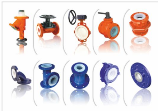
PTFE / Teflon Lined Pipes & Fittings