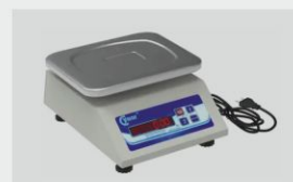
Specific Gravity Analyser