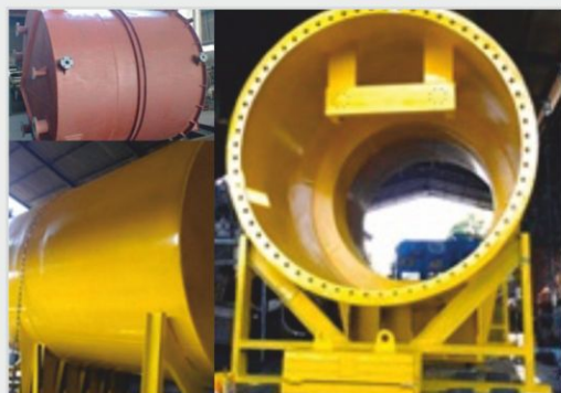
M.S./ S.S. Plant Equipments Fabrication