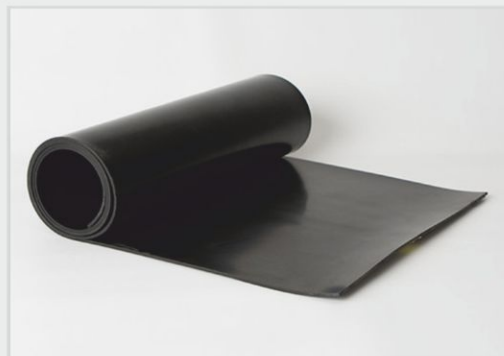
Rubber Sheets / Rolls