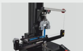
Peel off test for Rubber Lining