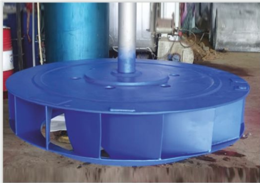
Teflon (PTFE) Coating