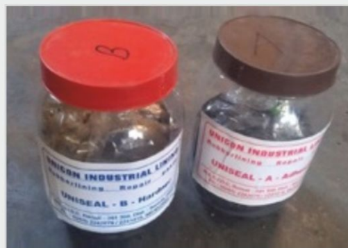
Rubber Repair Compound / Putty