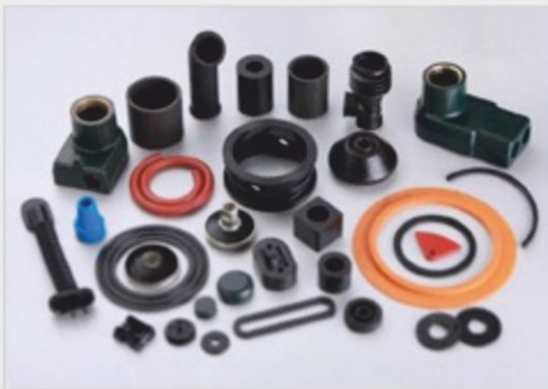
Moulded Rubber Products / Gasket & Packing