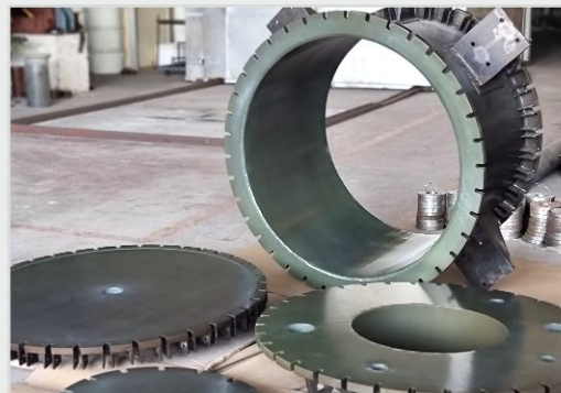
ECTFE Coating (Halar)