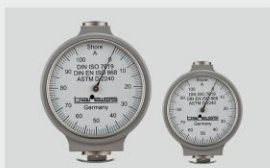
Rubber Hardness Tester