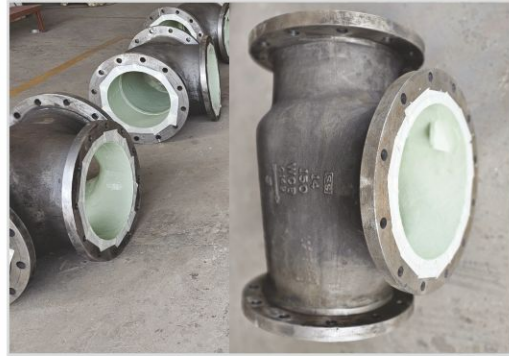
Glass Flake Epoxy Coating