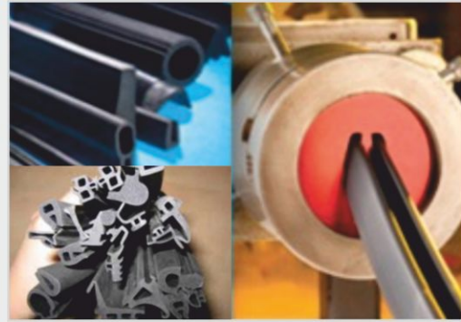
Rubber Extruded Profile