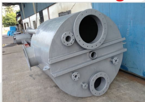
FRP Lined Equipments