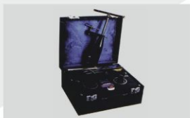
Spark Testing Machine