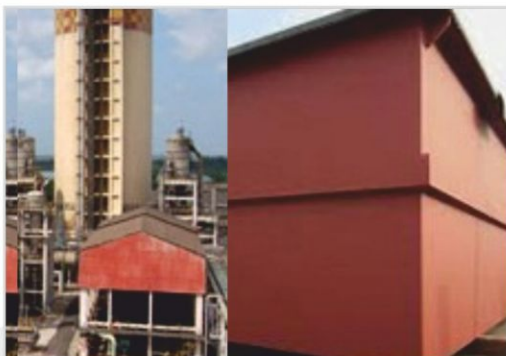
Onsite Rubber Lining