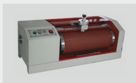
Din Abrasion Machine