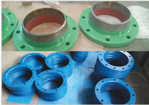
Fusion Bond Epoxy Coating