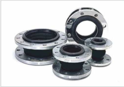
Rubber Expansion Bellows