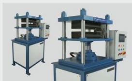
Lab Molding Press