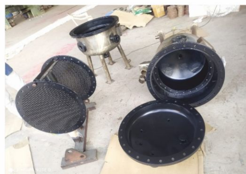
Antistatic Halar Coating