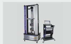
Universal Testing Machine